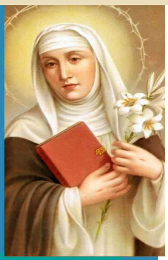
"Be who God meant you to be and you will set the world on fire"