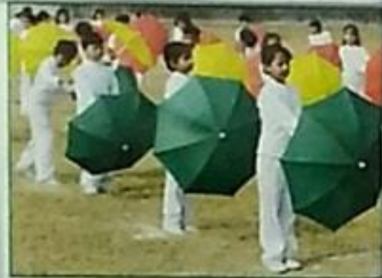
It was a great occasion for us to participate.